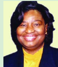
General Manager City of Los Angeles Department of Transportation